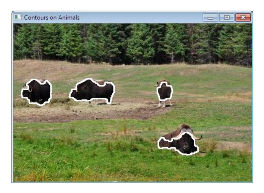
Figure 8.4 Contour of image obtained.

After that, we got total number of object with its shape descriptors as shown in figure 8.5, using function: