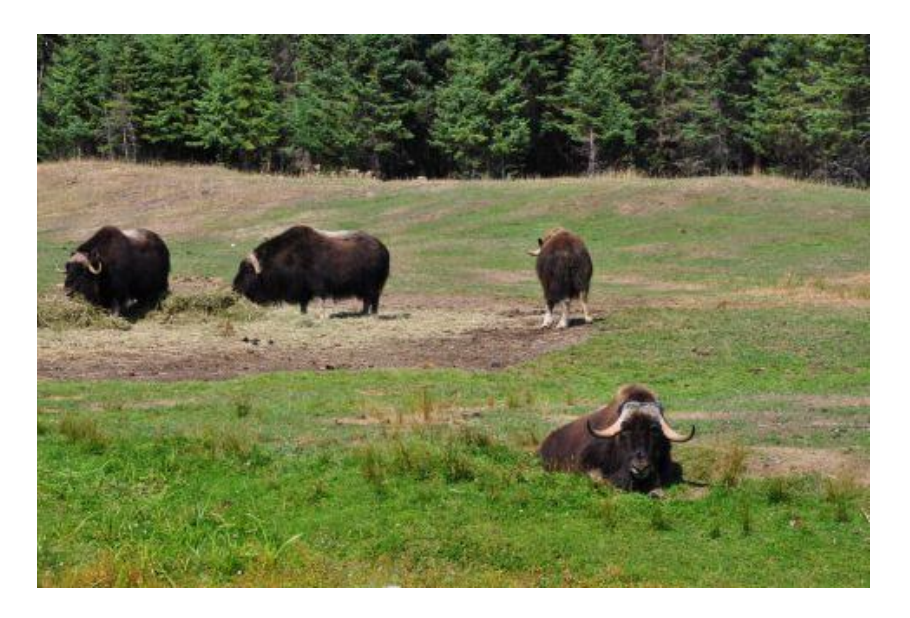
Figure 8.2 Testing image.

Then the result of binary image from fig. 8.2 shown in figure 8.3: