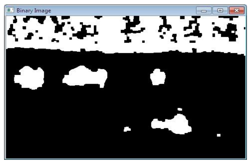
Figure 8.3 Binary image.

Then the result of binary image from fig. 8.2 shown in figure 8.3: