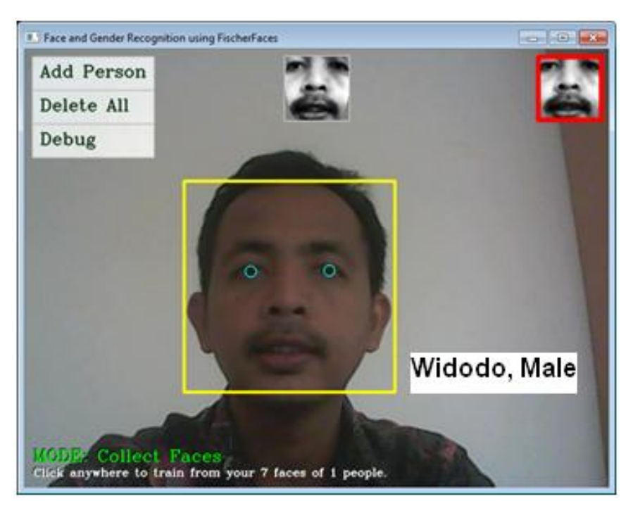
Figure 9.6 Face and Gender Recognition Systems (improved from [21]).