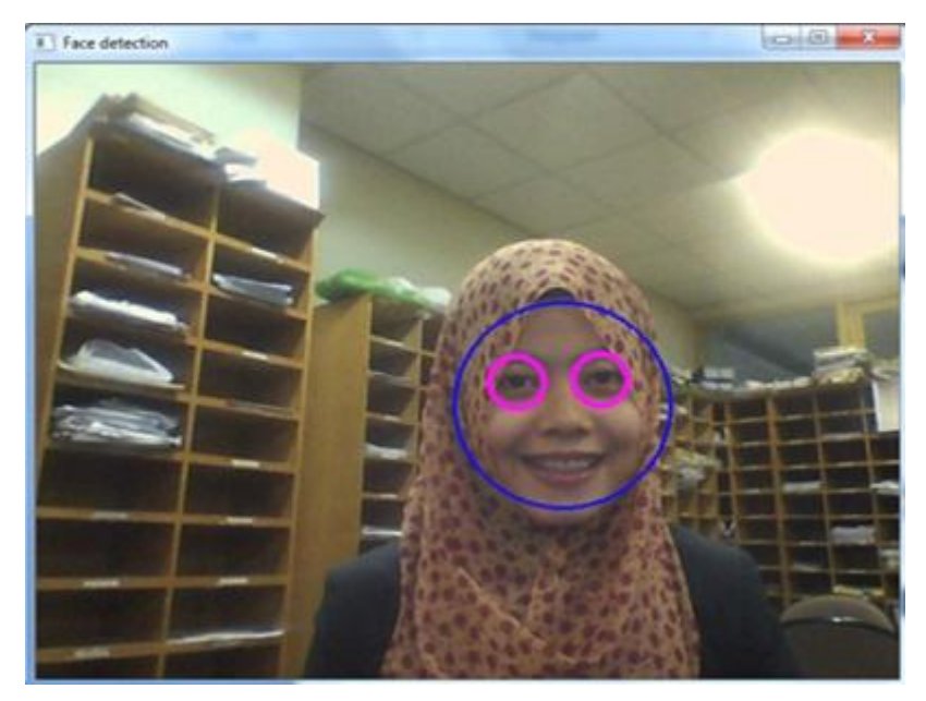
Figure 9.2 Result of face detection using Haar classifier.