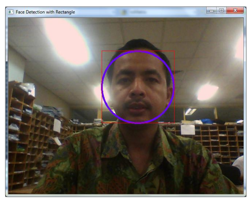
Figure 9.3 Face detected using rectangle.

Program below show an example for face detection with rectangle: