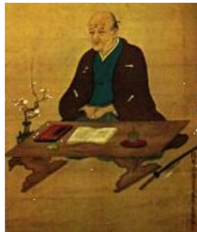
Fig. 10.2 A Confucian, Ekiken KAIBARA (1630~1714).