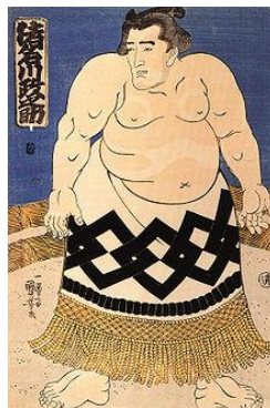
Fig. 10.3 Obesity has two types.

In the primitive ages, human beings had often had no food and had been hungry for a few weeks. It is now thought that they kept motionless in the caves and kept their bodies warm. We can surmise now that the genes concerned with consumption of energies had been conserved. This gene was named 'thrifty gene'. Even now, mammals which hibernate have the thrifty gene in their adipose tissues and they keep body heats from going down. We, human beings, also have the thrifty genes now, a trace of old days, which is sometimes called obesity gene or starvation one and now some people get fat because of these genes. Therefore, we must not blame such people for their fatness, saying that they are lazy or weak-willed. There are some people among them who can use received energies very efficiently.