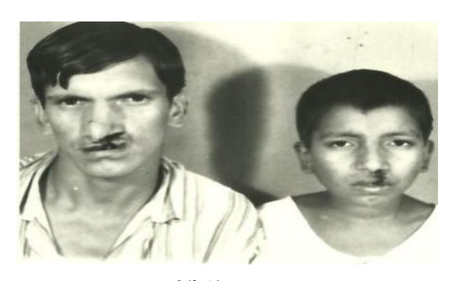
9.1b. After surgery